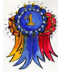
First Place Ugly Sweater