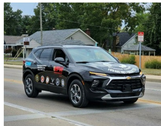
Annual Suicide Awareness Walk @ Post 1587