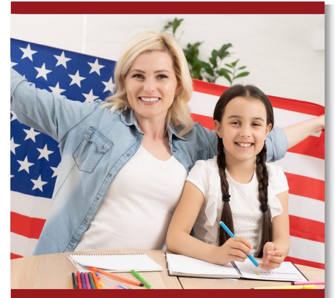
Recognize teachers who care about America!

Based on the nominees submitted, VFW chapters, called Posts, will recognize teachers in the following categories, K-5, 6-8 and 9-12. Posts then submit these winners' names and required documents to their District-level judging, who will forward their winners to the Department (or state) level. If your Department does not have a District judging, then submit to your Department Headquarters by Jan. 1. After judging, each Department then forwards their winners to VFW National Headquarters for consideration in the national awards contest.